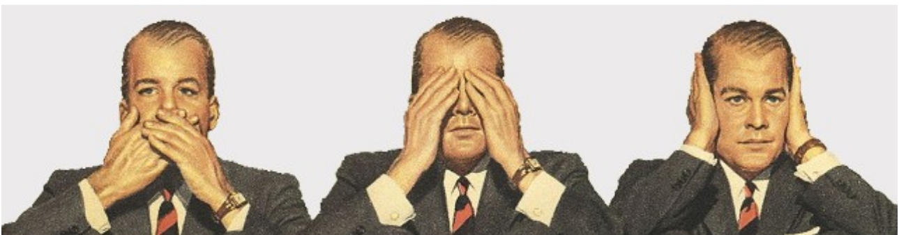
MHRA – Dedicated Team

In other words the MHRA appraisal is highly sensitive to extremely rare ADRs but is likely to hide, rather than reveal, the more common side effects that are killing people. The MHRA are using a system that will obscure serious problems with the jabs. The only signals their dedicated team might discuss with experts will be “extremely rare.” They won’t see any signals for more common adverse events and can therefore overlook the obvious and ignore the danger.