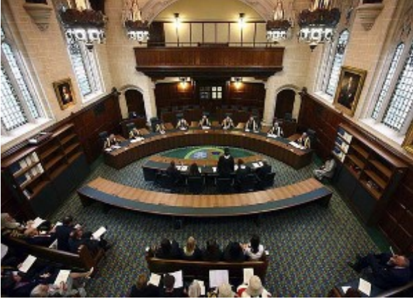
UK Supreme Court

There are those who suggest that the “common good” warrants slavery. They state, based upon assumption and ignorance, that when a person refuses COVID-19 vaccination they are putting others at risk and behaving in a way that jeopardises the common good. They maintain that society should have the right to violate the bodily integrity of its slaves.