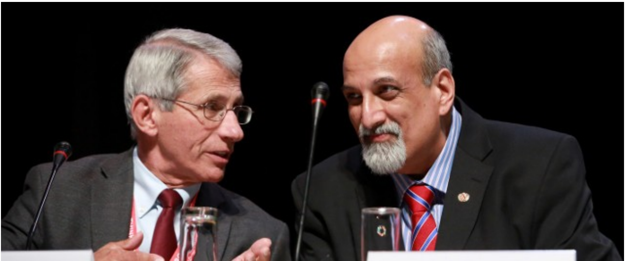
Anthony Fauci (left) & Salim Abdool Karim (right)

If the jabs are incapable of stopping infection and transmission and serve only to reduce natural immunity, there is no possible public health rationale for a jab mandate. An uninfected individual is no more likely to catch COVID-19 from an unjabbed person than they are from a jabbed citizen. According to the official definition of a COVID-19 case, the statistics show that the jabs don't make any difference whatsoever to the spread of disease.